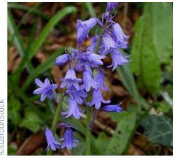
Spanish bluebell Hyacinthoides hispanica Erect spikes of wide, bell-shaped, pale blue flowers with blue pollen. Now the most common bluebell in urban areas.