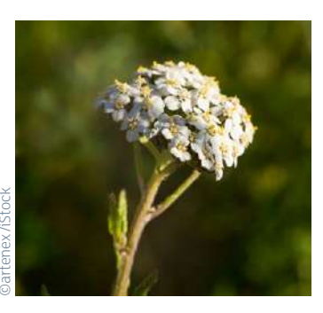
Yarrow Achillea millefolium

Large, nodding yellow flowers with 4 petals. A native flower grown in gardens and often found on walls, pavements and shaded banks.