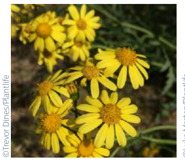
Oxford ragwort Senecio squalidus

Small white flowers in tight globe-shaped clusters. Leaves have 3 oval, toothed leaflets usually with a whitish band.