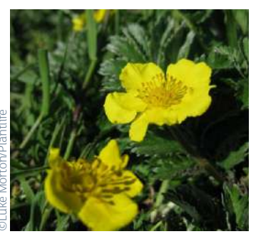
Silverweed Potentilla anserina

Easily recognisable with strong, long tangled stems, white/pink flowers or deep black fruits. Stems can be spiny, prickly or hairy.