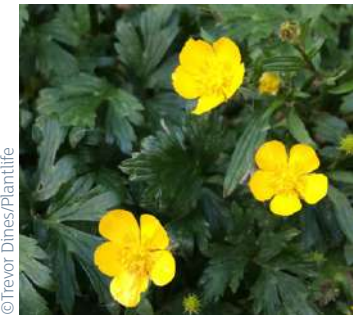
Creeping buttercup Ranunculus repens

Pretty little flowers, usually white but sometimes pink, grow in tight groups that resemble flat umbrellas. Leaves are feathery.