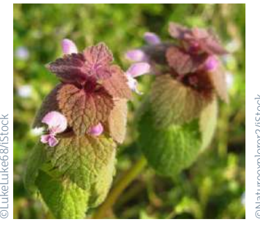
Lamium purpureum Dead-nettle's pink-purple flowers cluster amongst hairy, heart-shaped leaves towards the top of the plant and can bloom from February to November.