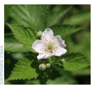
Bramble Rubus fruticosus

A semi-tropical annual with 5 or 6 petalled flowers in clusters on hairy stems. Grows from discarded fruit and around sewerage works.