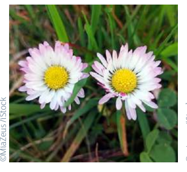
Daisy Bellis perennis

Familiar white/pink flowers with yellow centres. Thrives in areas of grass that are regularly mown or trampled.