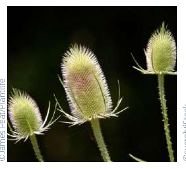
Wild teasel Dipsacus fullonum Up to 2m tall with distinctive egg-shaped flower heads with purple flowers and long spines