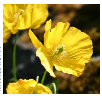
Welsh poppy Meconopsis cambrica

Bushy herb with stronglyscented feathery leaves and heads of daisy-like flowers. Often grows on walls, pavements and waste ground.