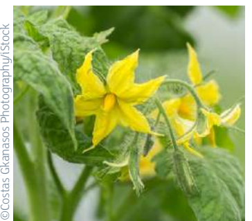
Tomato Lycopersicon esculentum

Like ragwort but with fewer, larger flowers and deeply divided leaves. Spreads along railways and is especially common around stations.