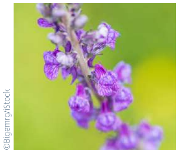
Linaria purpurea Has tufts of narrow bluishgreen leaves and long spikes crowded with tiny purple flowers. Often grows on walls, pavements and wasteground.