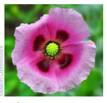
Opium poppy Papaver somniferum Annual with large, bluegreen leaves and large pink or lilac flowers. Edible poppy seeds come from this plant.