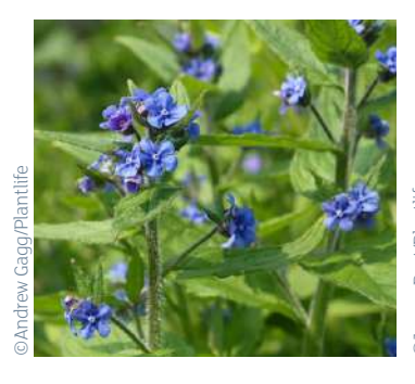
Green alkanet Pentaglottis sempervirens A large perennial to 1m with rough leaves and pretty blue forget-