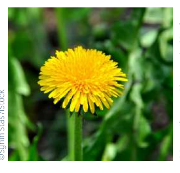
Dandelion Taraxacum officinalis

A low, spreading plant with creeping stems that root at the nodes. Leaflets are broad and often marked with whiteor brown.