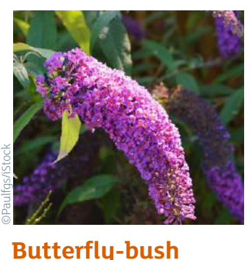
Buddleja davidii A large bush with long spikes of scented purple flowers, very attractive to butterflies. Common on wasteground, walls and railways.