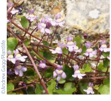
Ivy-leaved toadflax Cymbalaria muralis Little blue/purple flowers and reddish stems and leaves, often found on walls.