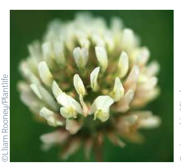
White clover Trifolium repens

Bright flowers above a rosette of jaggedly toothed leaves, followed by fluffy white seeds heads you can puff away to tell the hour of the day.