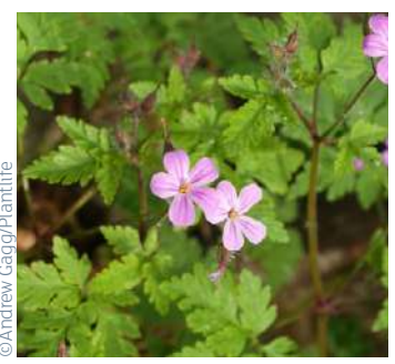
Herb robert Geranium robertianum Pink flowers 2cm across. Hairy leaves with a triangular outline are sometimes reddish and produce a strong, unpleasant smell.