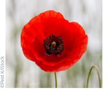
Common poppy Papaver rhoeas Annual with striking red flowers found where soil has been disturbed,