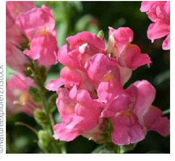
Antirrhinum majus A common garden flower seen in a wide variety of bright colours, often found on pavements and walls. Squeeze the flowers to open their mouths.